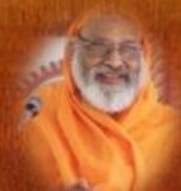
Swami Dayananda Saraswati (Founder)

Educating rural India through Free Student Homes